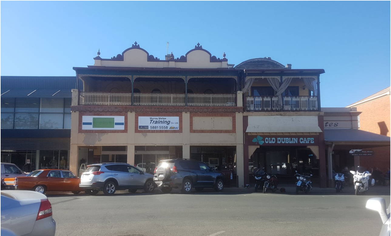
t 3 - Ground floor - Currently tenanted